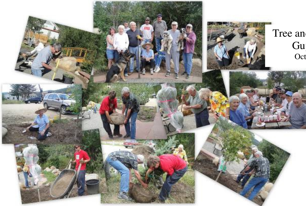
Tree and Bulb Planting Guyer Garden October 29, 2009